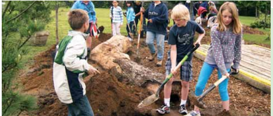
Tweedsmuir Public School

Bird Studies Canada's mission is to further the understanding, appreciation and conservation of wild birds by promoting public participation in science-based conservation and monitoring programs. By using remote audio recording units to collect bird survey data, it was able to broaden opportunities for public participation in conservation-related activities. TD FEF funding allowed Bird Studies Canada to further develop its ecological monitoring.