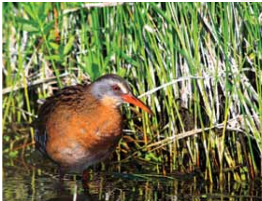
Bird Studies Canada

Thanks to funding from TD FEF, students at Tweedsmuir Public School now have a Learning Garden – a shaded, outdoor classroom where they can learn about nature and the local environment. In an effort to foster environmental stewardship values, and to increase their awareness of their connection to the natural world, students also help to maintain the Learning Garden.