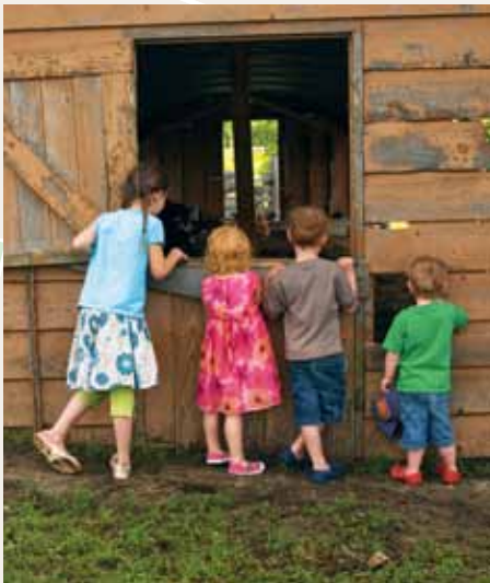
Everdale Organic Farm & Environmental Learning Centre

Everdale provides hands-on educational experiences focused on sustainable agriculture, renewable energy and alternative building methods. By using farm-based education as a platform for environmental education, Everdale's Discovery Farm allows students to escape from the classroom and make a physical connection to their food. TD FEF funding enabled Everdale to expand their youth outreach program, which now serves approximately 7,000 students annually.