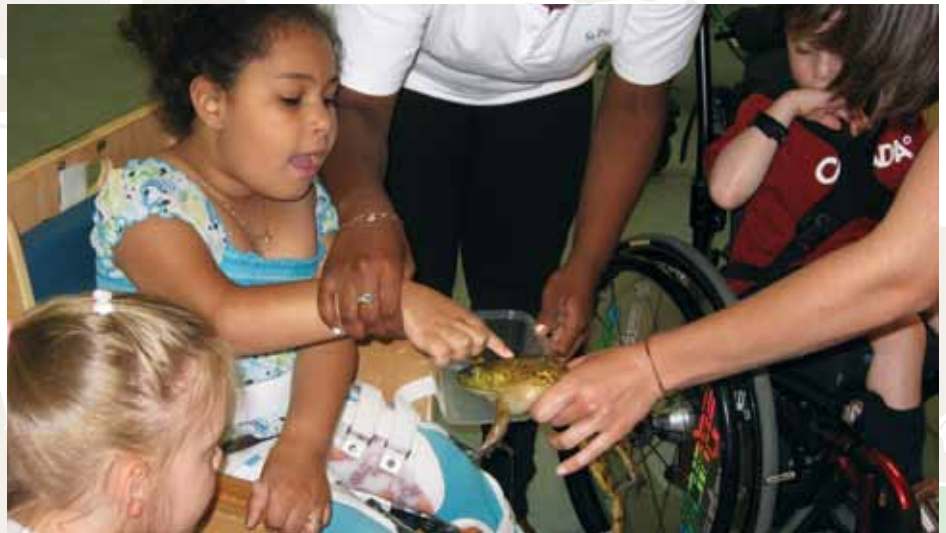
St. Lawrence River Institute

EcoSpark's Wattwise program empowers students to run student-designed electricity conservation campaigns in their schools. Conservation Coaches mentor students to conduct energy audits, design energy conservation plans and measure results. The program goal is to achieve a four per cent month-to-month reduction in school-wide energy consumption by year-end. TD FEF funding has allowed EcoSpark to deliver programming in the GTA region.