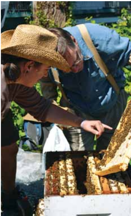
Environmental Youth Alliance

The Environmental Youth Alliance is a youth-driven, non-profit organization dedicated to the health of our urban environment. With declines in both native and honeybee population across North America, the Pollinators Project seeks to educate community members on the importance of bees, and other pollinating species, to a sustainable food system and the overall health of the natural community. Thanks to support from TD FEF, youth were able to participate in a free four-month training program on sustainable bee management.